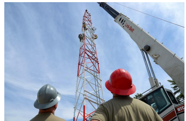
The final section of the structure was hoisted to the top by crane and bolted down by the Airmen.