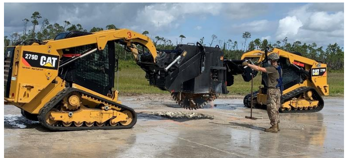
Using a spotter, Airmen use compact track loaders with wheel saw attachments to cut concrete around a damaged runway after a simulated attack during a Rapid Airfield Damage Recovery training on July 21, 2021, at the Silver Flag Training Site at Tyndall Air Force Base, Florida.

"Before RADR, airfield repair operations were built to support single airframes," Born said. "Today we have an adaptive solution that supports all airframes and professionally trained Airmen."