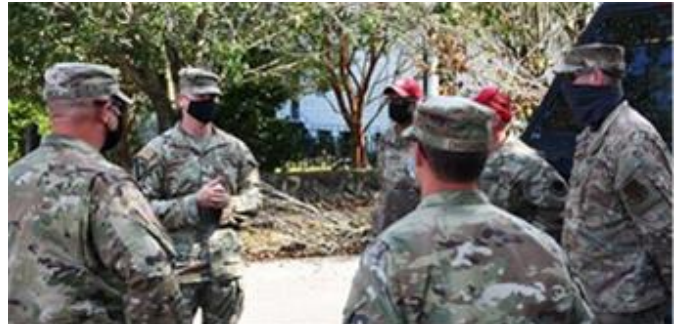
Louisiana National Guard senior leaders visit with EMAC Guardsmen from Arkansas National Guard and Florida National Guard who are part of the 2,676 Guardsmen from eleven states that are currently assisting in recovery from Hurricane Ida.

Once notified of an EMAC request for support, RED HORSE works fast to assemble a team with the necessary tools to respond within a 24-hour window to EMAC members.