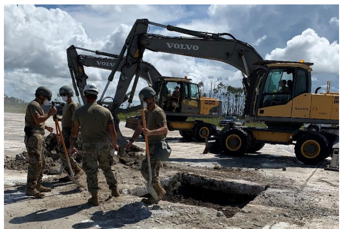
A team of Airmen along with two others driving excavators, work together to remove debris from a simulated battle-damaged runway crater 24-inches beneath the surface.