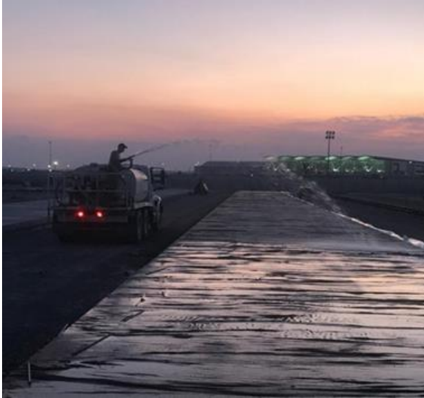
A1C Brandon Chestnutt, an Airfields Journeyman assigned to the 557th Expeditionary Prime BEEF Squadron, waters burlap sitting on top of a newly poured concrete lane at Erbil Air Base, Iraq, on 31 October 2019. (Photo and article by Capt Amela Sanders)

Wherever the next call may come from, the 557 ERHS is prepared to answer and provide combat readiness, anytime, anywhere.