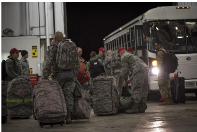
Airmen of the Ohio Air National Guard, 200th RED HORSE Squadron, Mansfield, Ohio, depart for Puerto Rico following activation by Ohio Gov. Mike DeWine in response to Puerto Rico earthquake relief efforts, Jan. 17, 2020.

The DRBS provides basic necessities such as shelter, latrines, and shower facilities and can support up to 300 people.