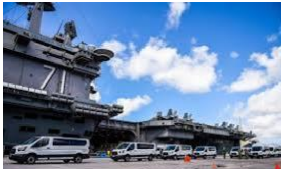
Vehicles arrive to transport sailors who tested negative for coronavirus from the ship, docked in Guam, on April 10, 2020. Photos AFP

(U.S. Navy photo by Mass Communication Specialist 3rd Class Alex Perlman/Released); Story page 4.