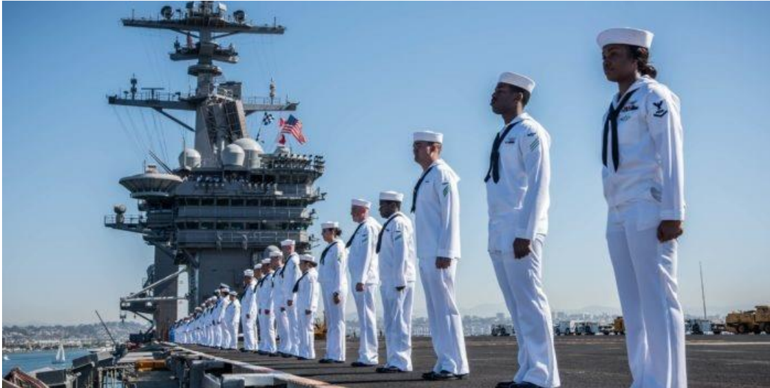
Virus Grounds a U.S. Aircraft Carrier as Crew Quarantined in Guam

Scores of the crew aboard the USS Theodore Roosevelt, a U.S. Navy aircraft carrier, have tested positive for the CCP Virus (coronavirus) and are off the COVID-stricken aircraft carrier and into isolation on Guam.