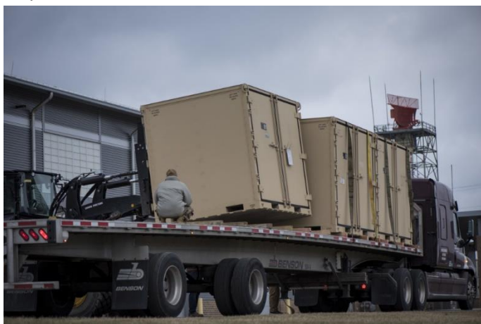
Airmen of the Ohio Air National Guard, both 179th Airlift Wing and 200th RED HORSE Squadron, Mansfield, Ohio, load Disaster Relief Beddown Sets onto trucks to be sent in response to Puerto Rico earthquake relief efforts, Jan. 16, 2020.

Each DRBS kit is self-sufficient with organic power and potable water systems which provides billeting, health and hygiene support for 150 people in support of domestic response activities.