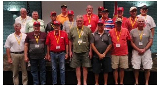
823 rd Vietnam Veterans

307 th Squadron has been deactivated so it was especially nice that the reunion gave them a chance to get together and gave us a chance to pay tribute to their many accomplishments and wish them well.