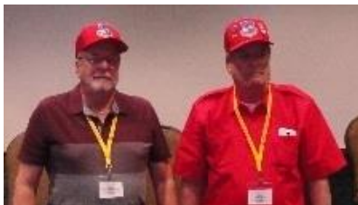
Original members of the 823 rd

823 rd Squadron was deployed to Bien Hoa in Oct 1966 with detachment units sent to Tan Son Nhut, Vung Tau, and Pleiku. They are currently located at Hurlburt Field.