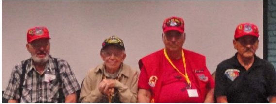
Original Prime BEEF members.