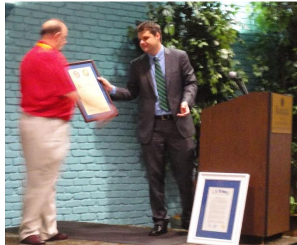
Florida District 4 State Representative Matt Gaetz presenting a commendation from the Florida House and Senate in honor of our Vietnam War Veterans to pay tribute to their contributions to our country.

"We are so blessed in this corner of the world to have our own RED HORSE presence," Gaetz added. "The work that they and you have done have helped to make America stronger, and the world a better place."