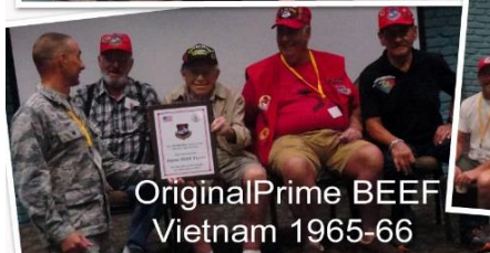
OriginalPrime BEEF Vietnam 1965-66