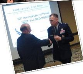
A few of the Prime BEEF and RED HORSE "Originals":