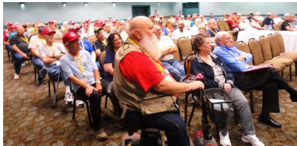
Opening Ceremony and Presidents Welcome