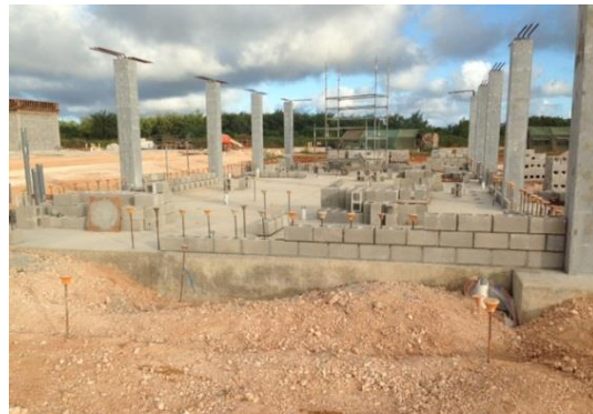
Expeditionary Kitchen Training Facility