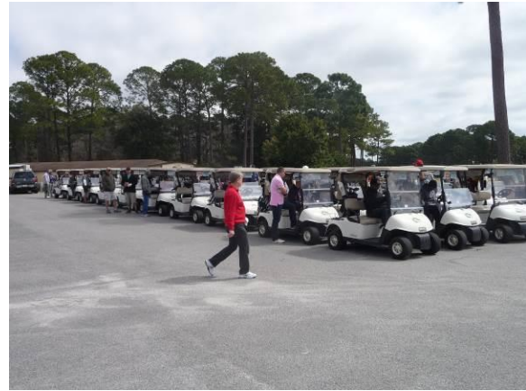
Golf Carts ready to go. . . .