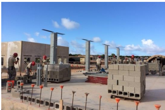
Student Latrine, Shower & Laundry Facility