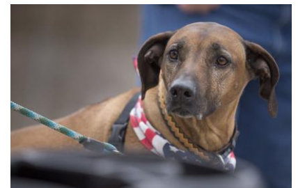
Cheerful Dozi has been attending 201st REDHORSE deployment ceremonies since she was a puppy.