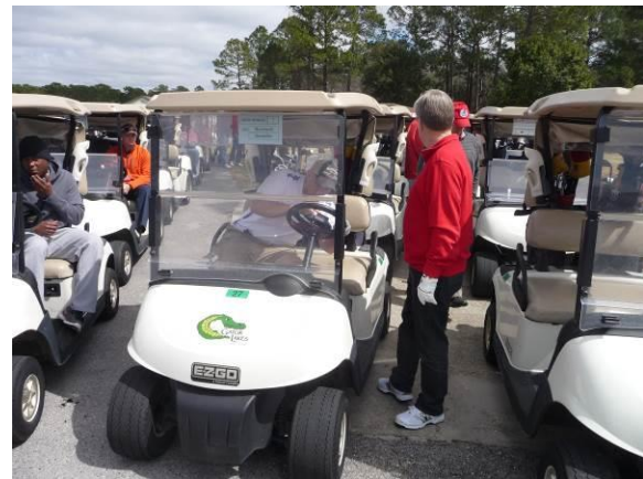
Close-up of golfers