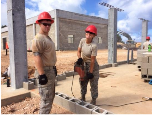
Command and Control Training Facility