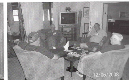
Plenty of stories to go around