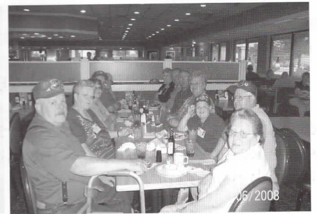
All enjoying a great meal together