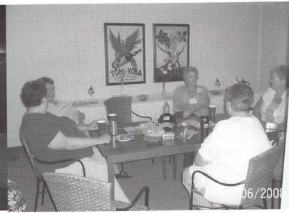
The ladies enjoying each others company