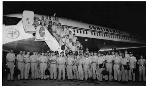
Construction Teams On Their Way To Vietnam For Urgent Protective Aircraft Revetments