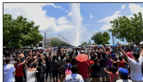
Firefighters assigned to the 36th Civil Engineer Squadron, spray a group of citizens.

THIS NEWSLETTER IS DEDICATED TO AIR FORCE MILITARY CIVIL ENGINEERS (REDHORSE AND Prime BEEF) PAST, PRESENT AND FUTURE