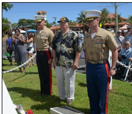
Marines place a ceremonial wreath at the Marine memorial.