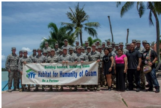
Airmen of the 134th Air Refueling Wing Civil Engineering Squadron, pose for a photo after completing their annual training building homes for charity.