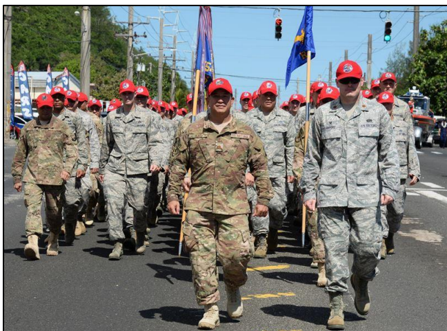
U.S. Airmen with the 554th and 254th Red Horse Squadrons march in the 72nd Guam Liberation Day parade in Hagåtña, Guam.

Military service members and their families joined the local community to commemorate 72 years since the day U.S. armed forces liberated the island of Guam from Japanese occupation and control during World War II. During World War II, Japan seized Guam on December 10, 1941, and on July 21, 1944, the U.S. armed forces liberated the island. (DVIDS Press Release, 21 July 2016.)