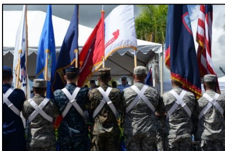
U.S. Service members present the colors at the celebration ceremony.