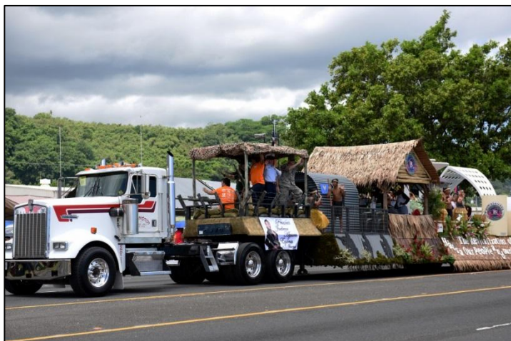
Liberation Day is celebrated every year on July 21 to mark the day Guam was liberated by U.S. armed forces from Japanese occupation during World War II.