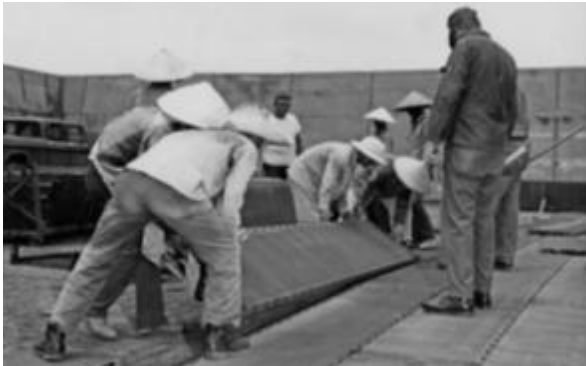
Tan Son Nhut, ADC team had to provide parking area for F-100 aircraft.

All revetment construction was completed by the teams on Oct 23, 1965 well ahead of schedule. The teams were then instructed to assist the base engineers with construction backlog until their departure in early December 1965.