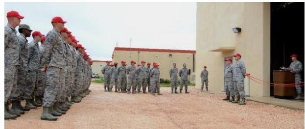
Airmen with the 556th, 554th and 254th RED HORSE Squadrons attend a ribbon cutting ceremony July 26, 2016, at Andersen Air Force Base, Guam.

The EOD warehouse will be utilized for Silver Flag training and will store items such as Humvees, bomb suits, EOD robots and training equipment.