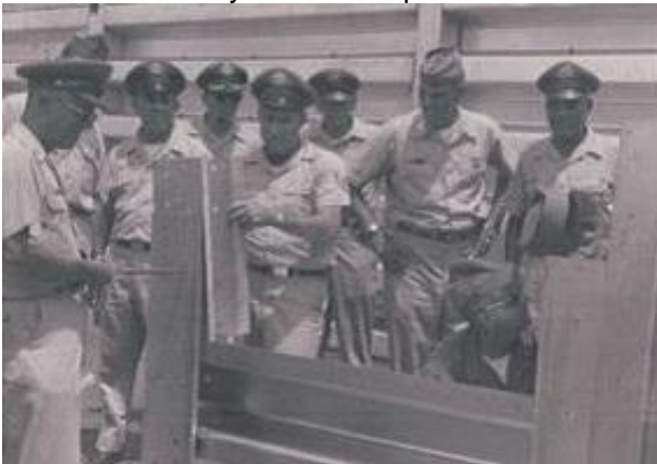
Survey / Planning Teams Determine Urgent Requirements